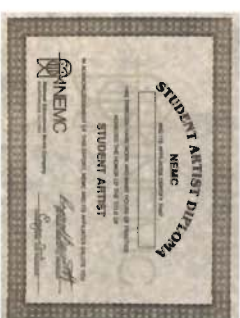
YOUR STUDENT ARTIST DIPLOMA (Actual size = 9" x 11" including frame)